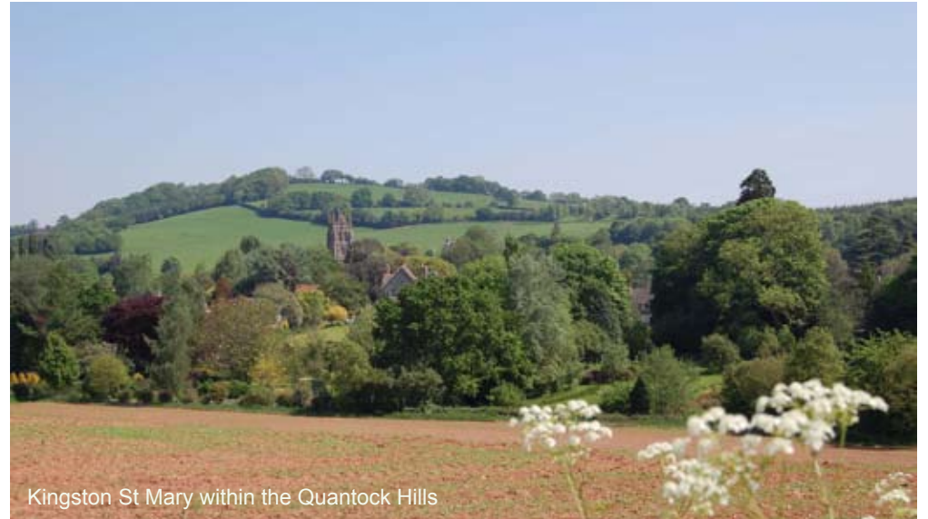
Kingston St Mary within the Quantock Hills