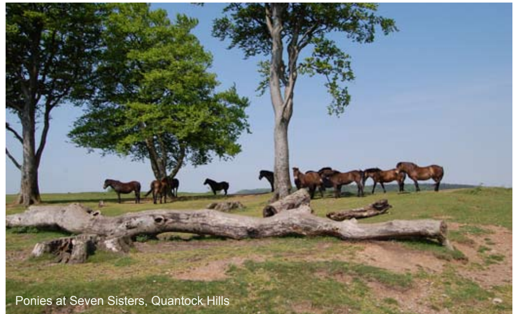
Ponies at Seven Sisters, Quantock Hills