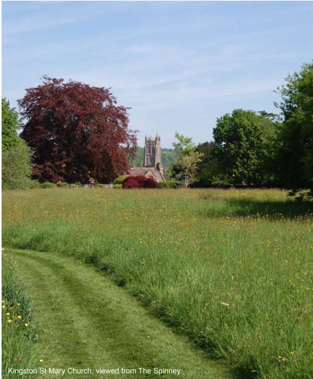
Kingston St Mary Church, viewed from The Spinney