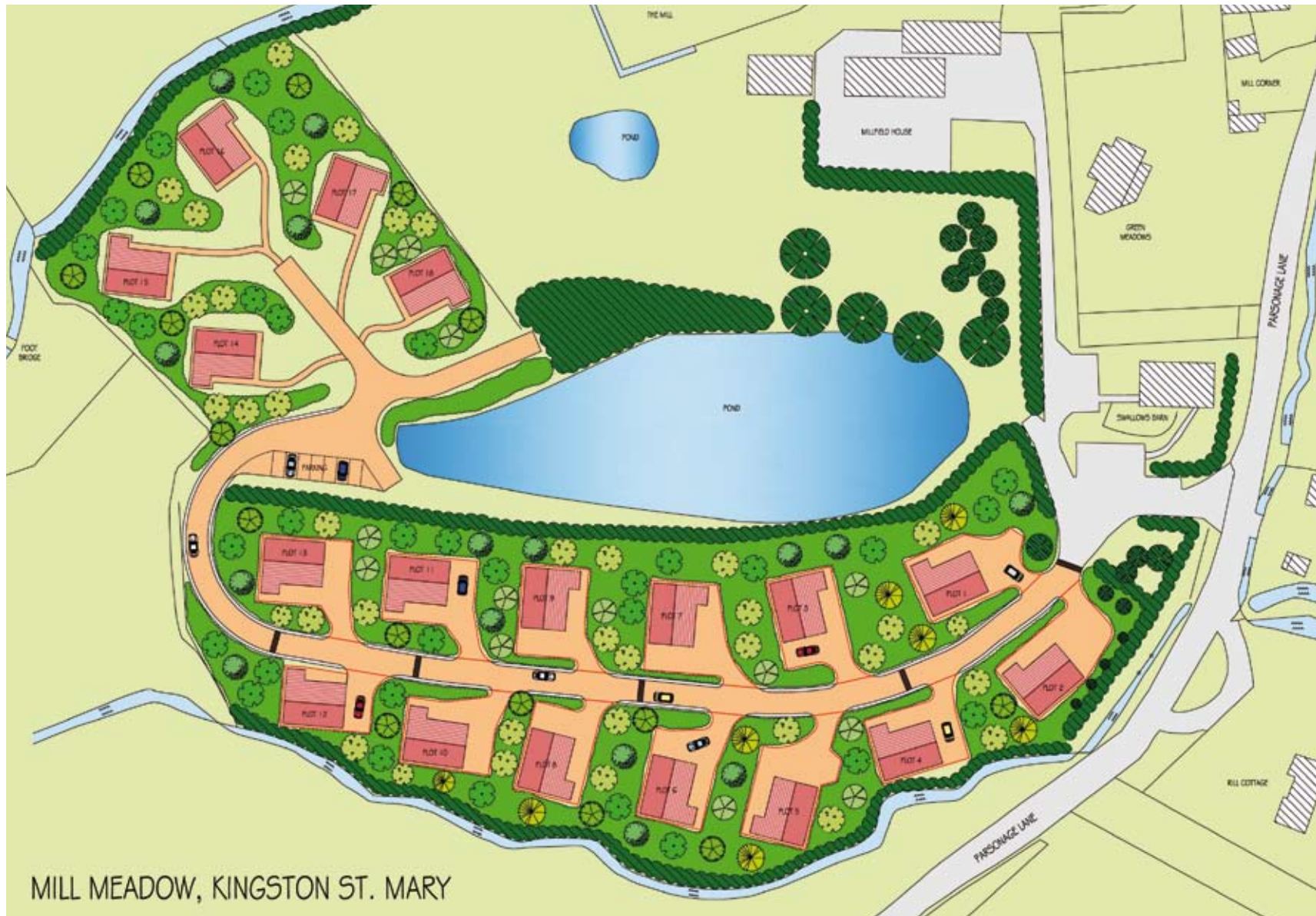
MILL MEADOW, KINGSTON ST. MARY